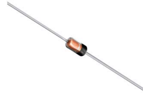
DO-35 Hermetically Sealed Glass